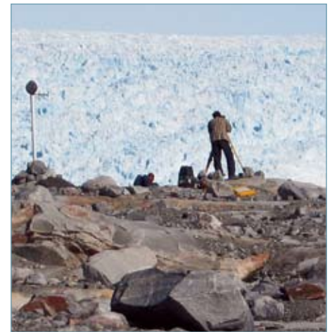
Jakobshavn Isbrae glacier

EOS SCIENTIST Mark Fahnestock has teamed up with researchers from the Geophysical Institute at the University of Alaska Fairbanks (UAF) to investigate the recent, rapid acceleration of a large Greenland outlet glacier by deploying Global Positioning System receivers directly on the glacier. Jakobshavn Isbrae (background) flowed at a stately 20 meters per day for the last half century, but recently accelerated to 40 meters per day in response to the loss of a floating ice tongue that blocked rapid progress down the fiord.