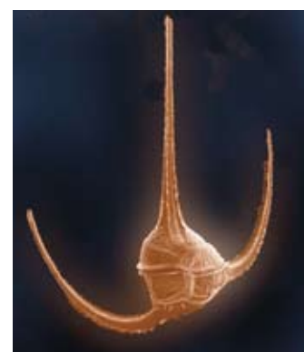
The dinoflagellate Ceratium longipies, a common phytoplankton in the Gulf of Maine.